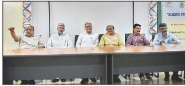
The guests on dais during the programme at Pandit Ravishankar Shukla University Raipur on Friday.