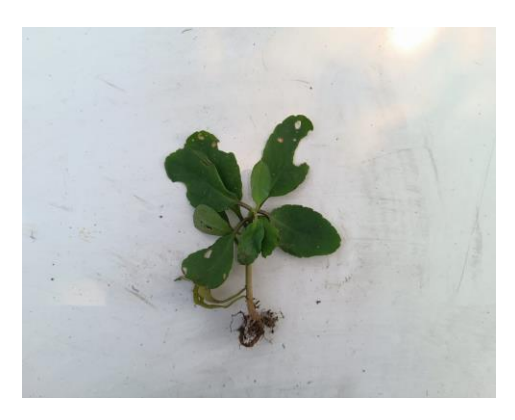
Pattharchatta (Bryophyllum pinnatum)