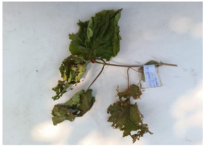
Haldu/Kalmi (Haldina cordifolia)