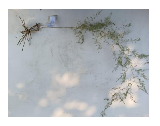
Shatavari (Asparagus Racemosus)