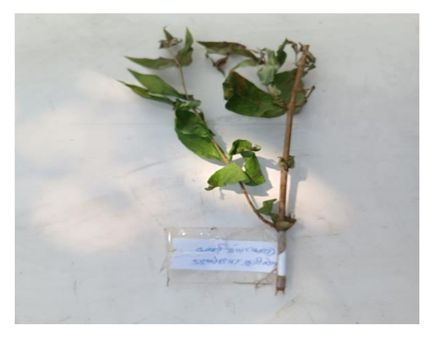
Dhawai phool (Woodfordia fruticosa)