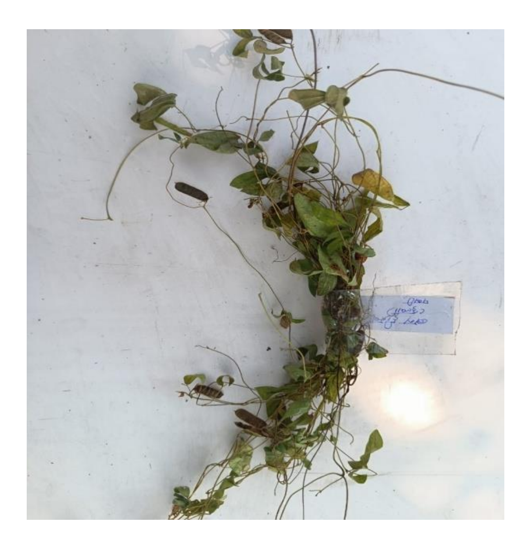
Kulthi (Macrotyloma uniflorum)