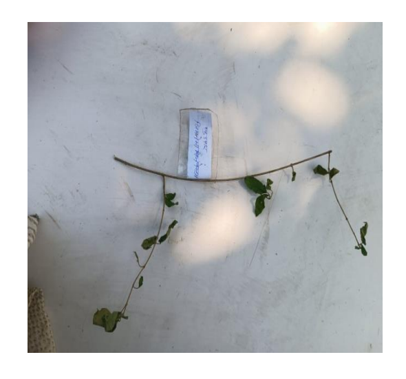
Gurmar (Gymnema sylvestre)