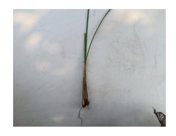
Nagarmotha (Cyperus rotundus)