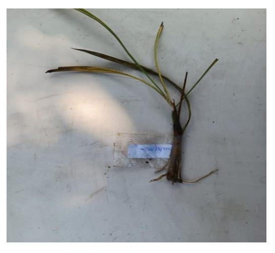
Kali musli (Curculigo orchioides)