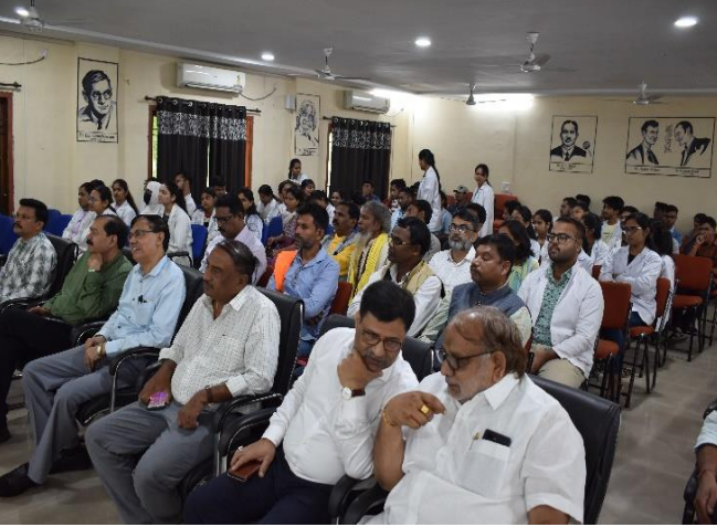
The attendees, ranging from students to professionals, are actively engaged in the session, with some taking notes and others listening intently to the speaker.