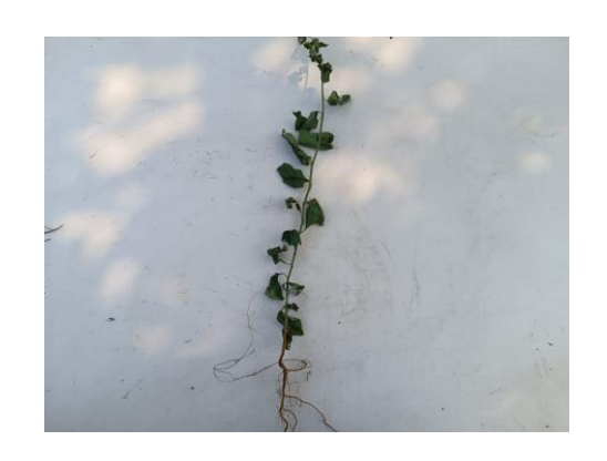
Chitrak (Plumbago zeylanica)