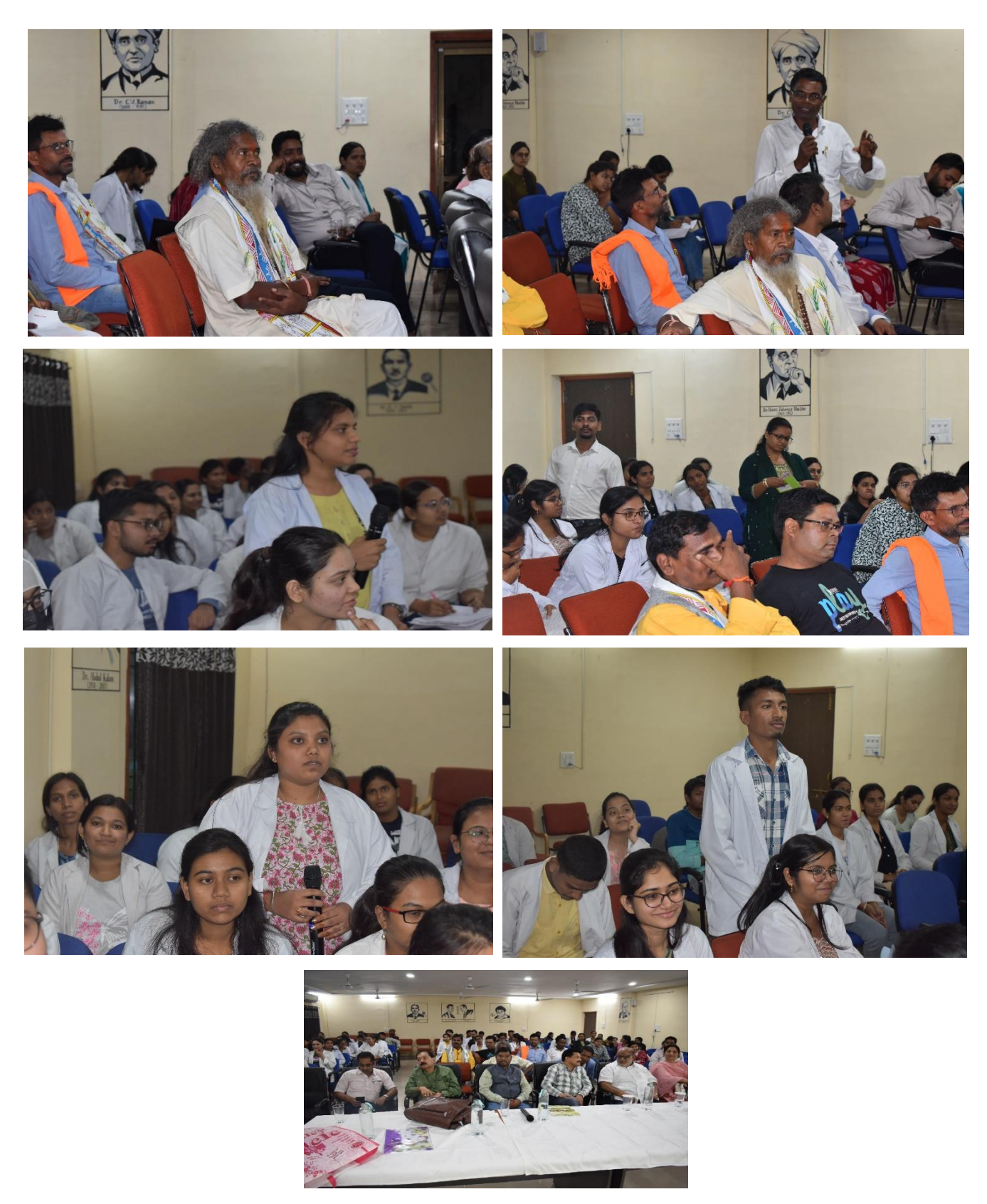
The session featured a vibrant Q&A segment where participants had the opportunity to engage directly with the speaker.