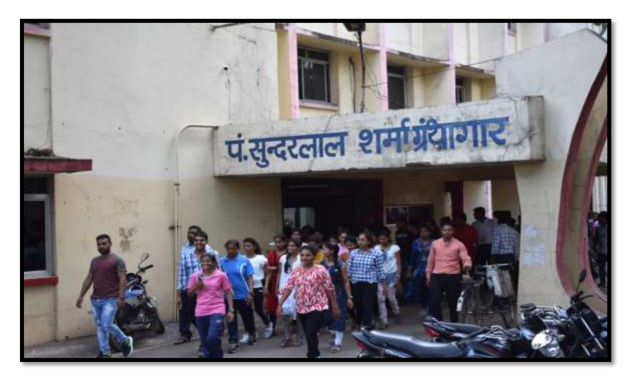
Visit to laibrary