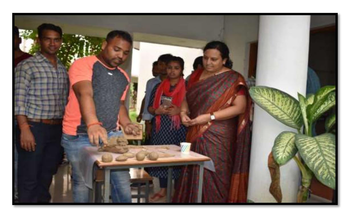
Clay Art Compitetion