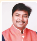
Shri Kedar Kashyap

Hon'ble Forest and Climate Change Minister, Chhattisgarh