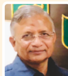
Shri Gopal Arya

Hon'ble Forest and Climate Change Minister, Chhattisgarh