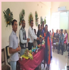
Wel-come Program for New HOD