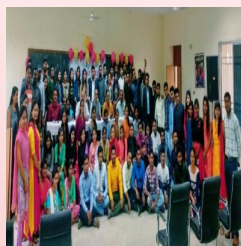
Alumni Meet Program of Social work