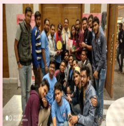
FM Tadka award received for work in ODF