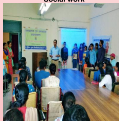
Induction Program (Diksharambh)