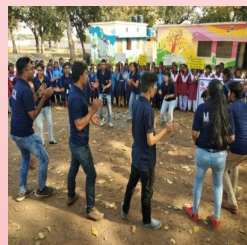
Rural awareness programme