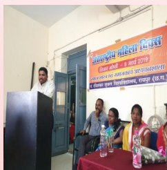
World Womens Day Program