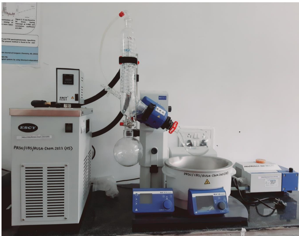
Fig : Rota Evaporator