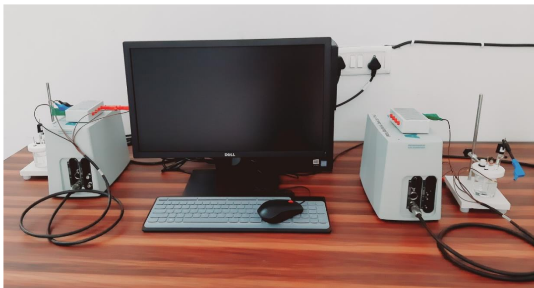
Fig : Potentiostat