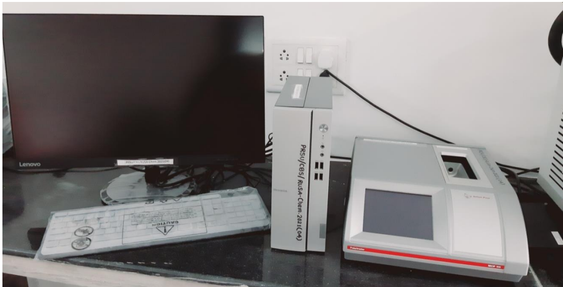
Fig : Polarimeter