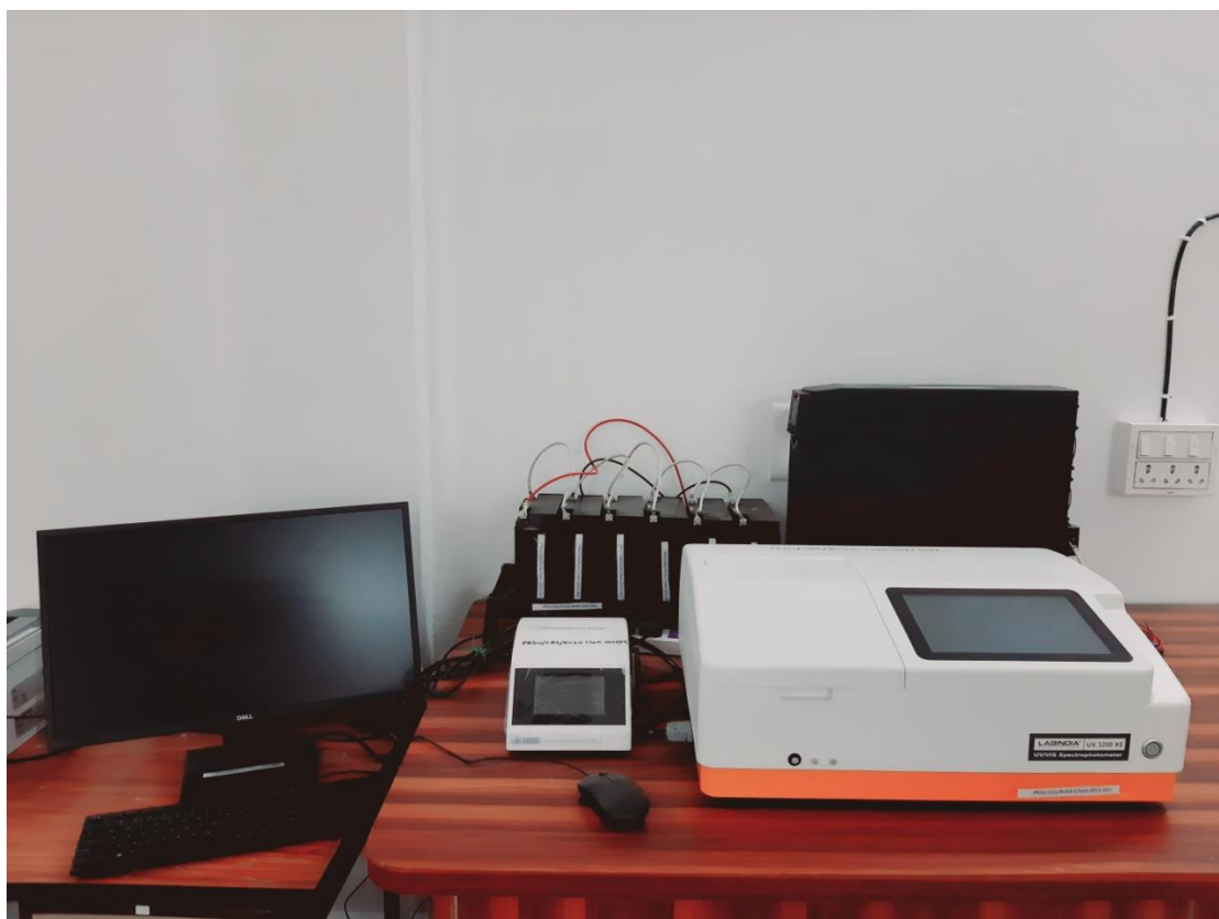
Fig : UV Spectrophotometer