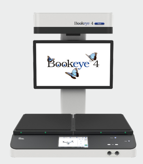
Front view of the Bookeve® 4 V2 Basic.