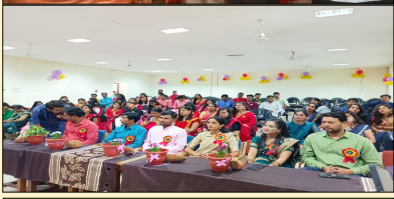
BASANT PANCHMI 2023