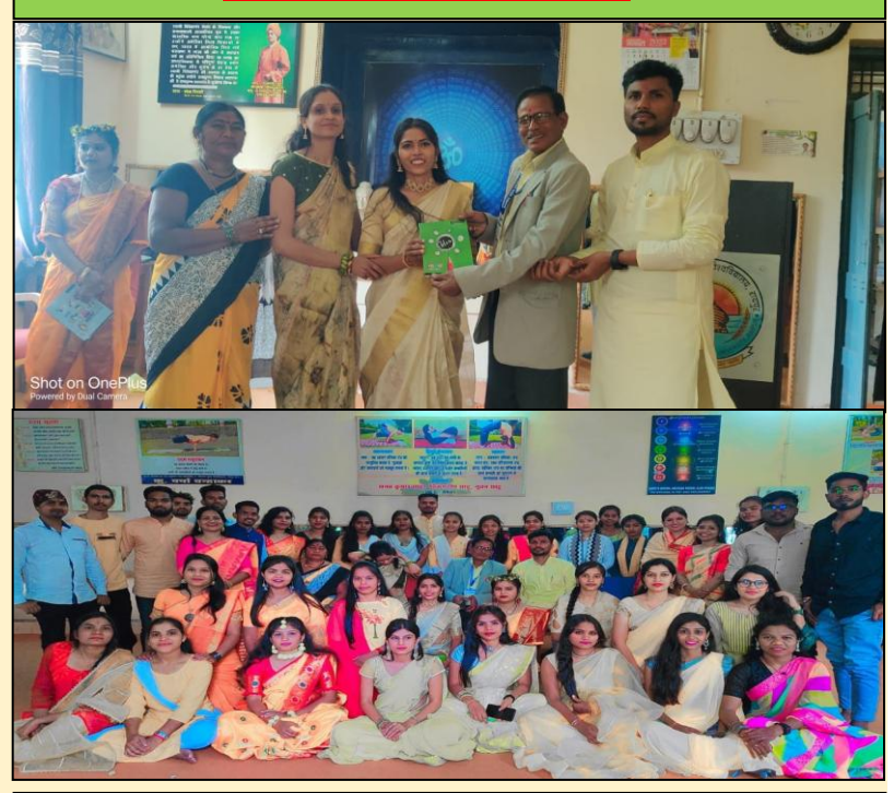
SWACHCHHATA ABHIYAN / KARMA YOGA