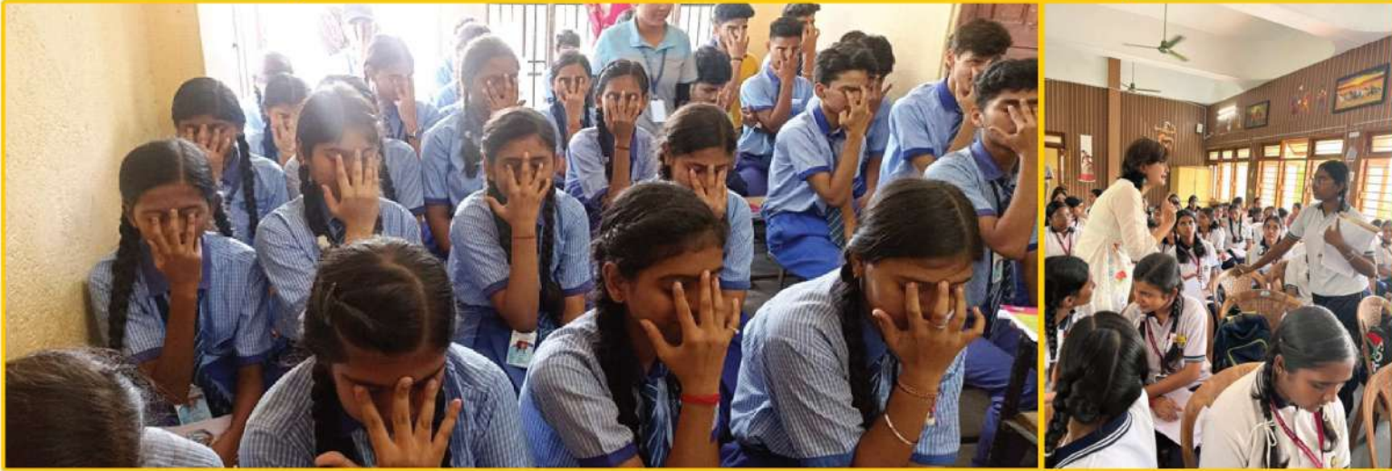
Project Karuna : Promoting Mental Health Awareness among school students