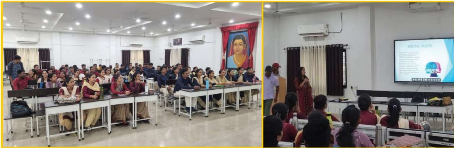
Promoting Mental Health Awareness among University students