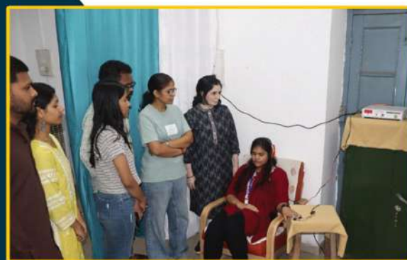
Biofeedback for stress relief

To create community of intellectual excellence and foster on evolving understanding of psychological science.