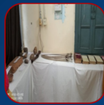
Museum and Archives Room