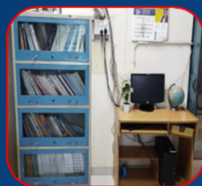
Computers with Internet