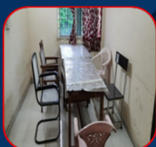
Research Scholars Room