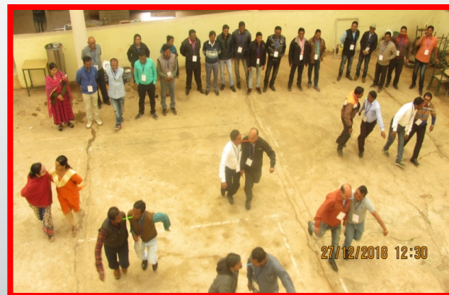
Participation in event activities