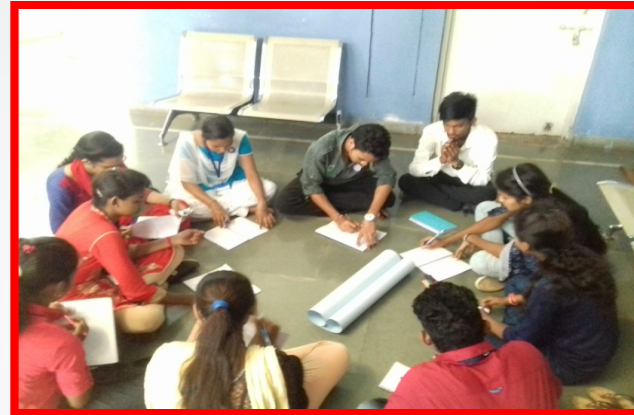
Participation of Students