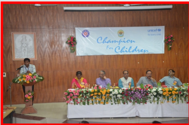
Experience Sharing of Participants