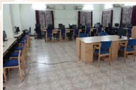
Remote Sensing and GIS Lab – FIST Funded