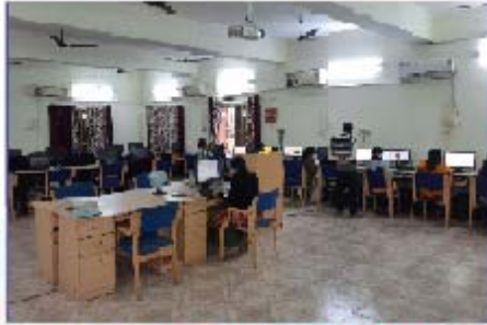
On hand Practice in RS & GIS Software