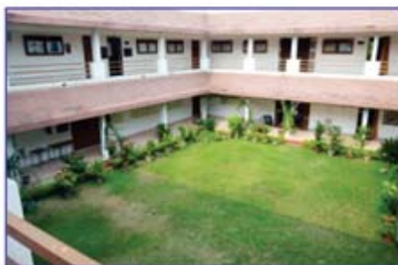
Separate Building - Estd. 2009

The SoS in Geography was initially started in the combined building of Arts' Block of the university teaching department and now it has been shifted to its own separate building since January 2009 (Total carpet area 1250 sqm). There is one Seminar Hall (162 sqm) and one Remote Sensing & Geographical Information System Lab. with 30 PCs, 01 Server, 02 A4 size Color Laser Printer, A0 size Plotter, A3 size Scanner, DLP Projector, Multifunctional Copier A3 size (Print, scan, Copy), 01 Total Station, 08GPS, one online UPS and Geomatica (license for 10 user), Arc GIS Desktop (ArcView) ENVI Plus IDL Spatial Analyst for Desktop (license for 1 user) and 21st Century GIS Software (license for 5 user). The SoS is enriched with Survey Instrument- Dumpy level, Theodolite. Lab Instruments – Stereoscope, Aerial Photograph, Satellite Imageries, Topographical Sheets