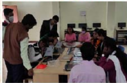
Orientation of Ariel Photographs under Mirror Stereoscope