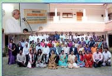
GEOGRAPHY ALUMNI MEET