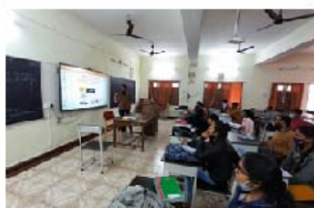
1 st Sem. Room Classroom