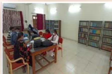
Dept. Library and Research Scholar Study Room