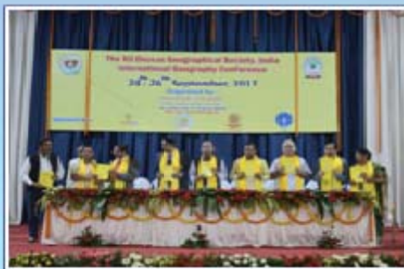
12 th DGS INTERNATIONAL CONFERENCE, 2017