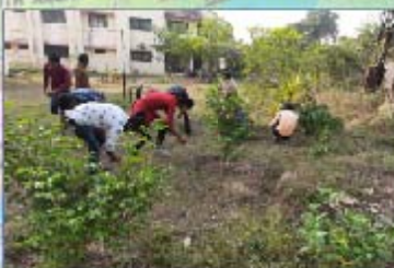
Swachh Bharat Abhiyan