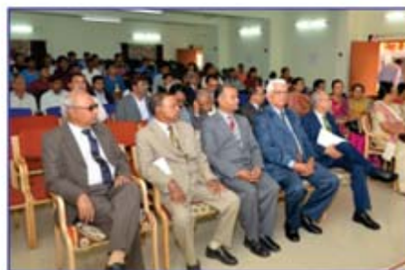
Air Conditioned Sem. Hall with ICT facilities