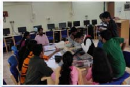
Visual Interpretation of Satellite Imagery