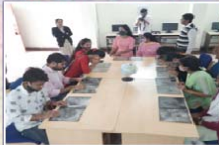
Orientation of Ariel Photographs under Pocket Stereoscope