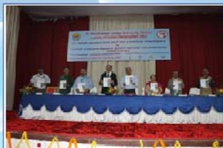
41 th IIG NATIONAL CONFERENCE, 2019