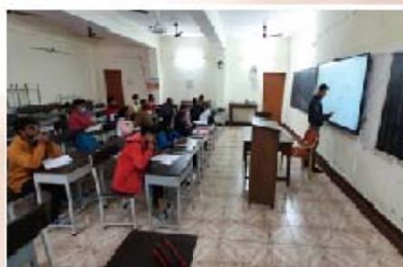
3 rd Sem. Room Classroom