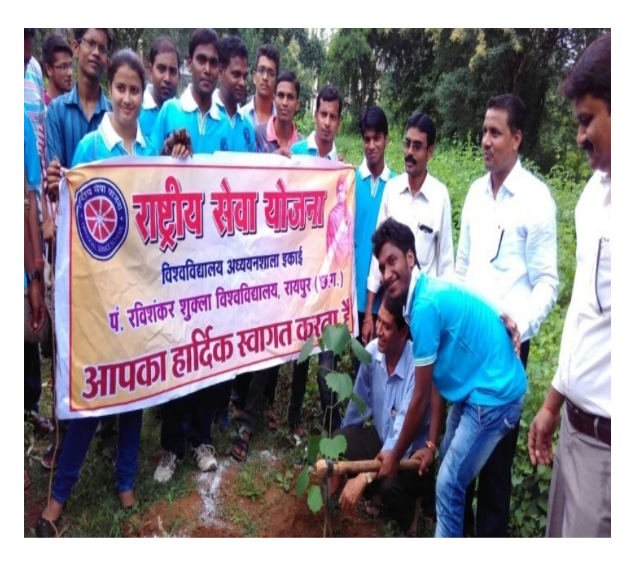
05 September 2016