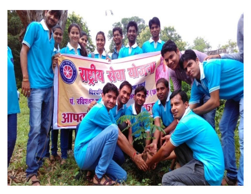
05 September 2016