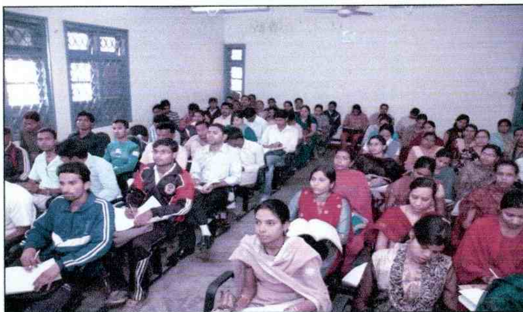
Photographs of NET Coaching 2016