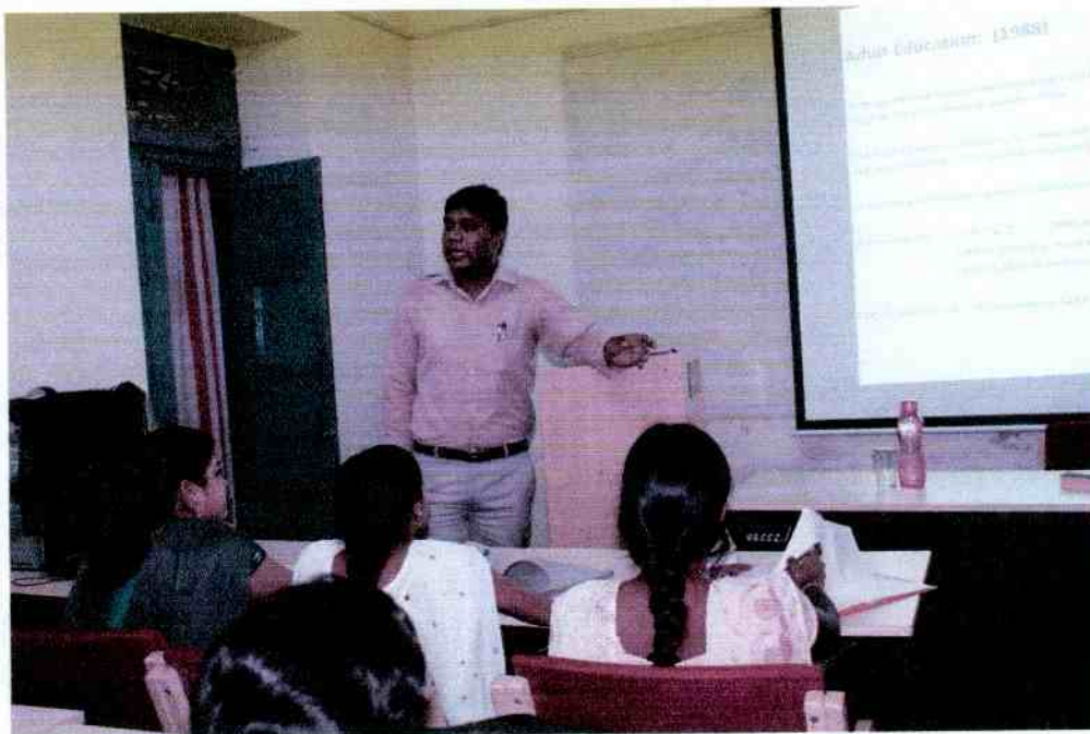
Photographs of NET Coaching 2018