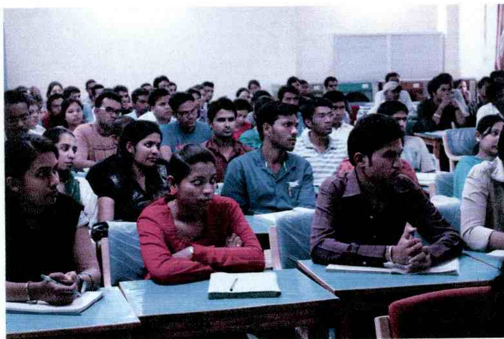
Photographs of NET Coaching 2019