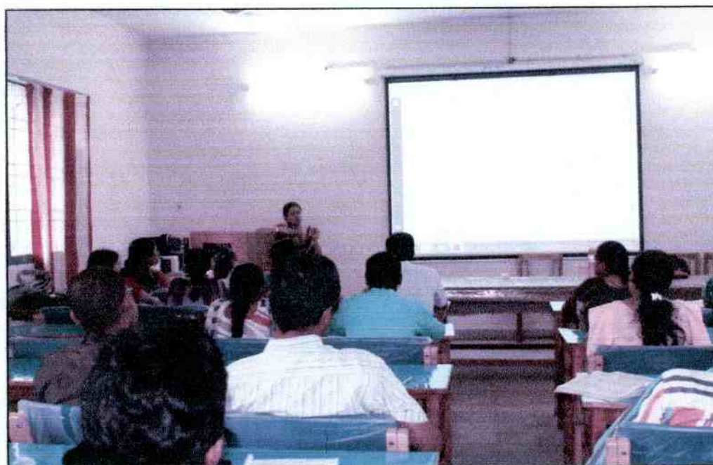
Photographs of NET Coaching 2017