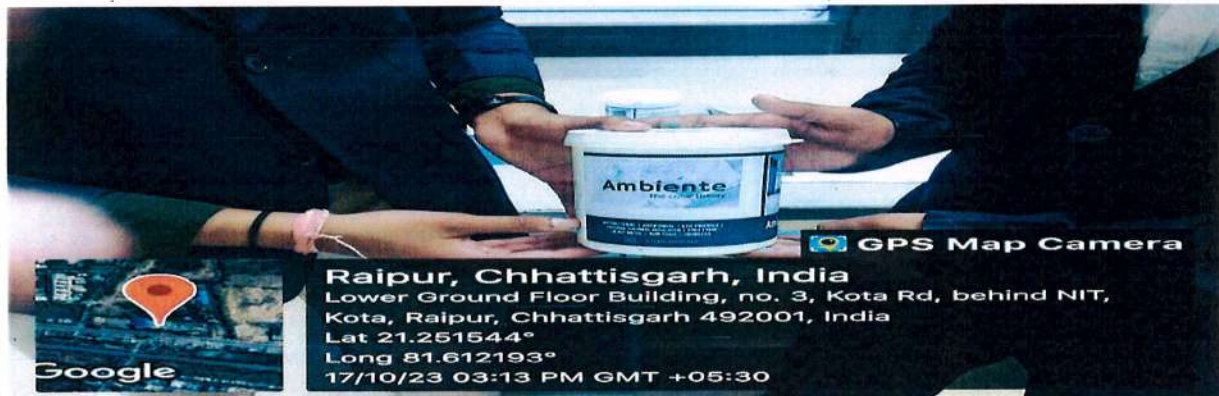
Incubation Cell Presentation by Students on organic paint.