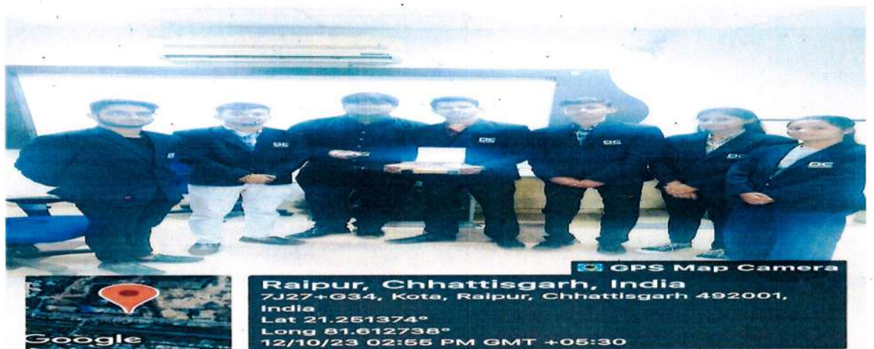
Incubation Cell Presentation by Students on Festive Gift Hamper for upcoming Festive Markets.