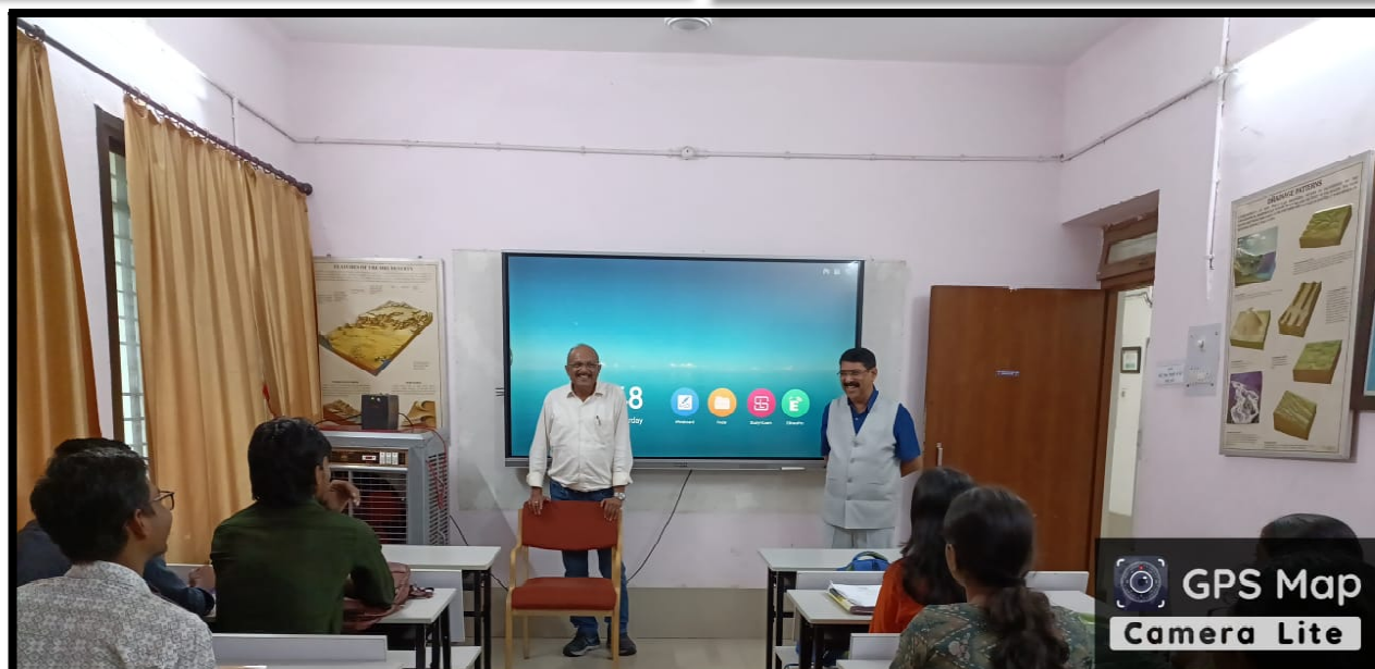
Geology Department, Pt.Ravi Shankar Shukla University Campus, Amanaka, Raipur, Chhattisgarh 492010, India

Altitude 295 meters Saturday, 19.07.2025