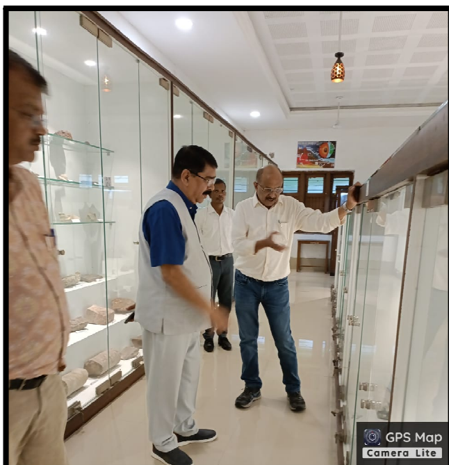
Geology Department, Pt.Ravi Shankar Shukla University Campus, Amanaka, Raipur, Chhattisgarh 492010, India