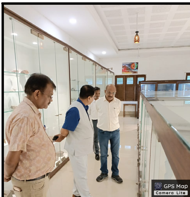
Geology Department, Pt.Ravi Shankar Shukla University Campus, Amanaka, Raipur, Chhattisgarh 492010, India

Altitude 295 meters Saturday, 19.07.2025