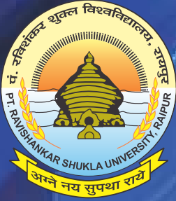
Pt. Ravishankar Shukla University, Raipur, Chhattisgarh, India