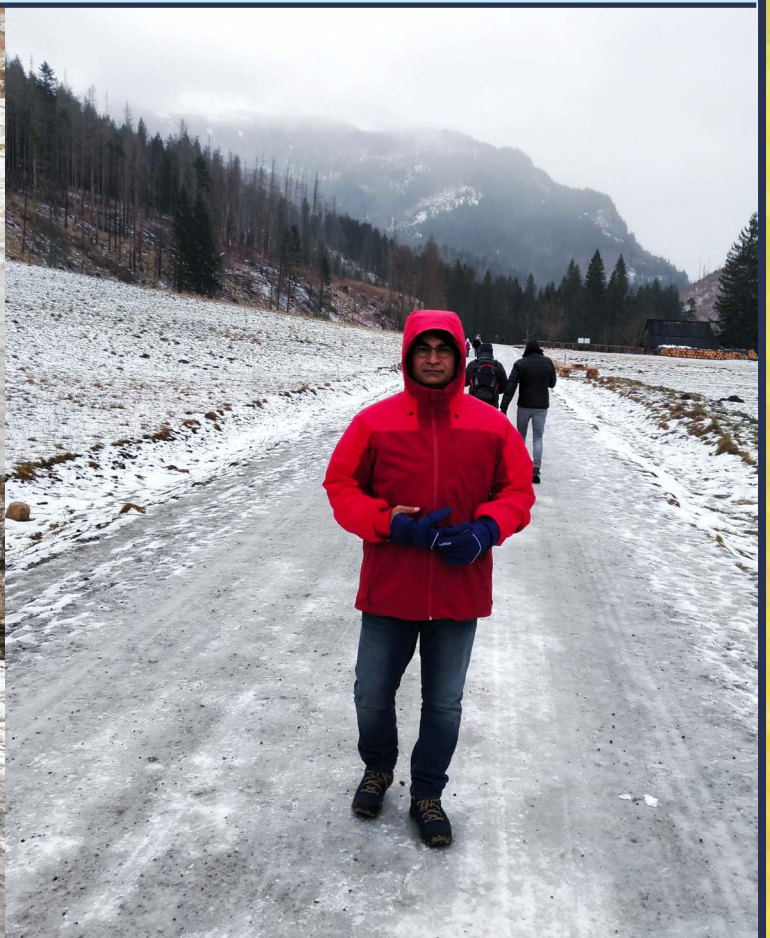
Trekking in Chochołowska Valley in Tatra Mountains, Polish winter capital called ZAKOPANE, Poland