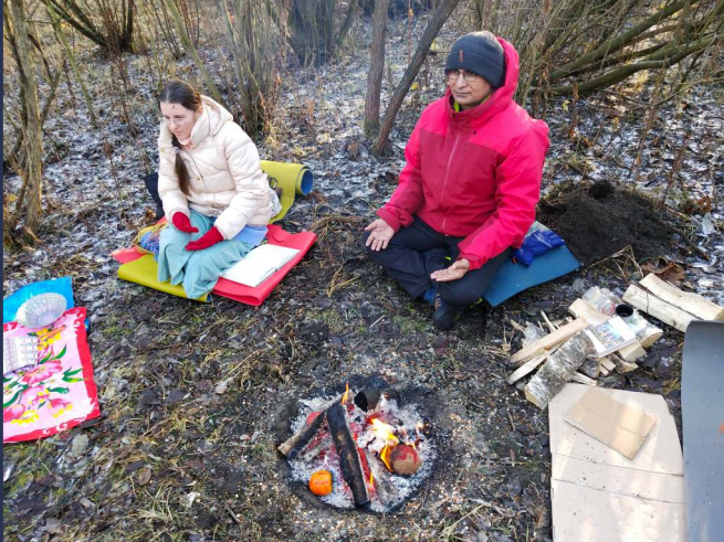
During Sahaja Yoga havan in Kamieniołom Liban, in Płaszów area, Krakow, Poland