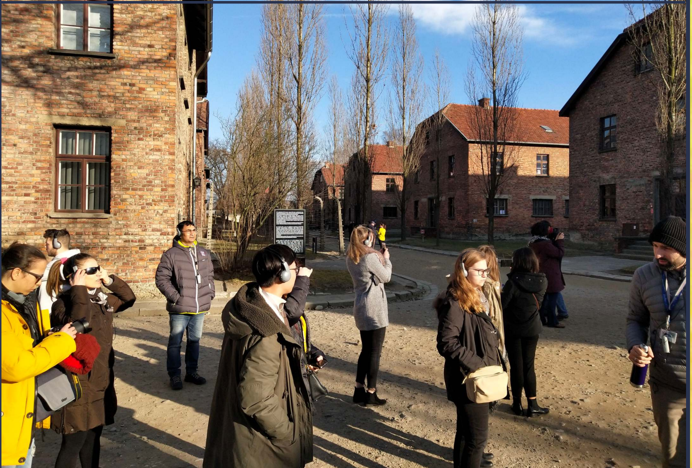
Visit to the largest and most brutal concentration camp called Auschwitz near Kraków, Poland