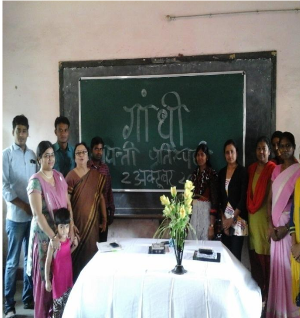
Mahatma Gandhi Jayanti 02oct 2015