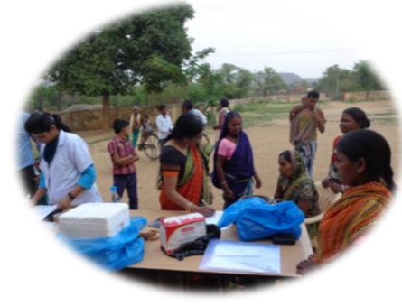
Photographs during socio-demographic and biological data collection