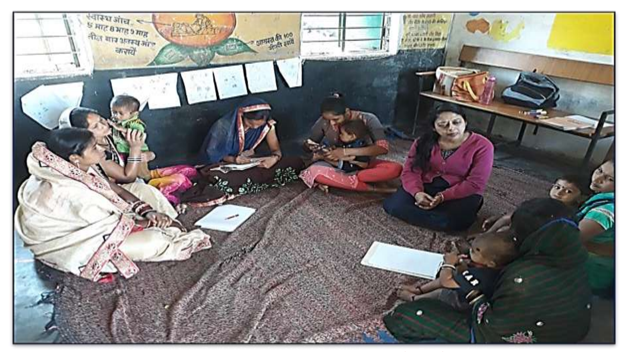
Focused Group Discussion (FDG)